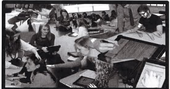
Woodford County High School NxGL Classrooms

learning modules with information, videos, and Prove-It quizzes. Before completing the Prove-It quiz, read all information and watch the videos presented. You may work on this little by little or all at once. Each Prove-It quiz requires a